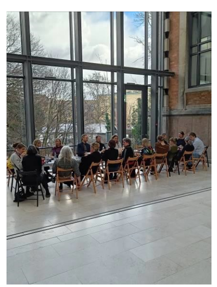
Lunch in the Sculpture Street