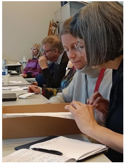
Examining the archive